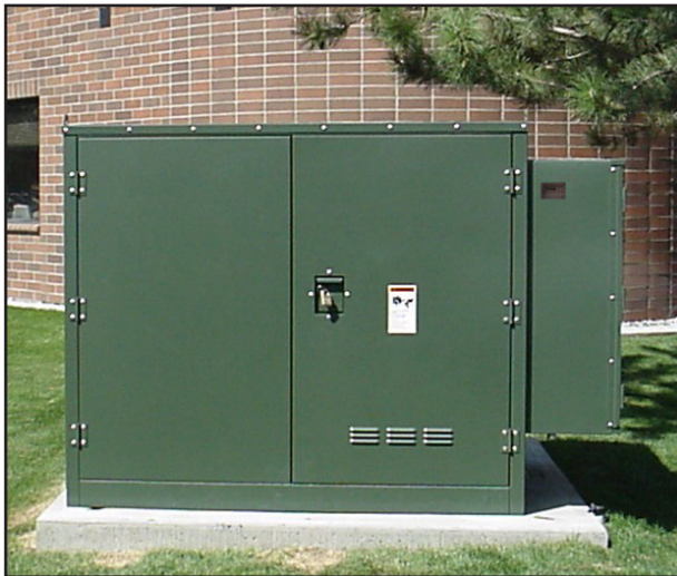
Automated switch for closed loop military system.

Due to the size of the project and the aggressive timetable, construction was implemented in phases. The first phase involved dividing most of the base into four radial loop systems each incorporating 5-7 automated switches being fed from the existing substation. Future phases would require additional automated switches and a new substation.