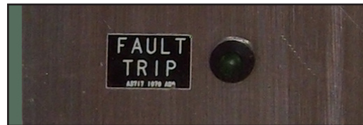
Fault Indicator LED Light